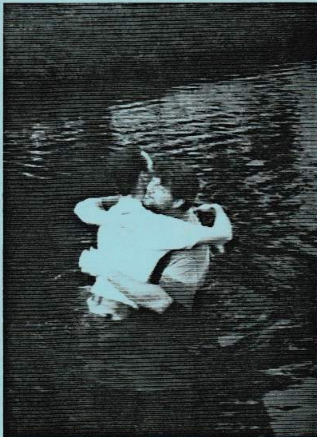
...me giving him a hug...