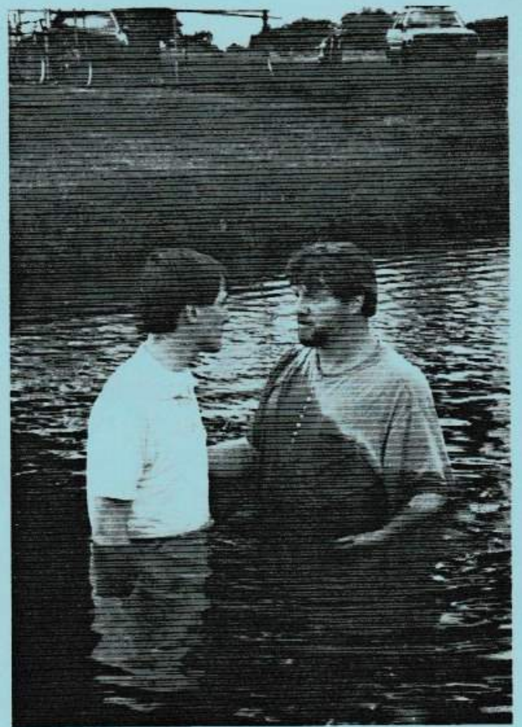
Kip asks me and I give my public declaration of Christ.