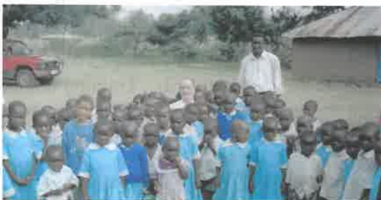
Above left: Most of these children are orphaned due to AIDS.