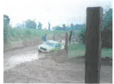
At right: very common for cars to get stuck in deep ditches on roads.