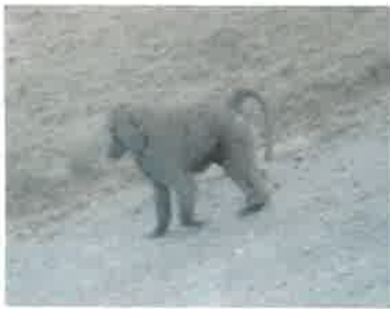
At left: a baboon on the roads.