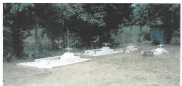
Above right: These are four of six graves of a family who lost all their children in six years.