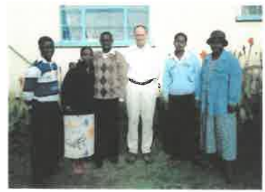
Pictured here with The staff of YWAM-Eldorate.