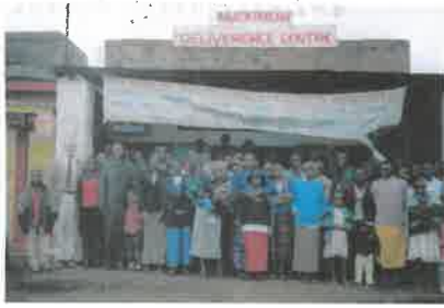
Pictured with a church that Lawrence & I taught at almost every night in one week including a crusade meeting.