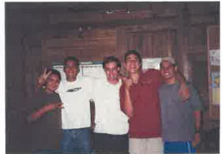
Below right: Returned to Kenya in 2005 for another School of the Bible outreach.