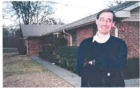
Below right: Here I am in 2002 with some students from YWAM-Nicaragua.